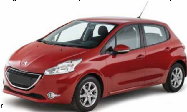
Shooting on ETS – SIUS ASCOR

Contact person: Adam Pogorzelski +48 509 669 237