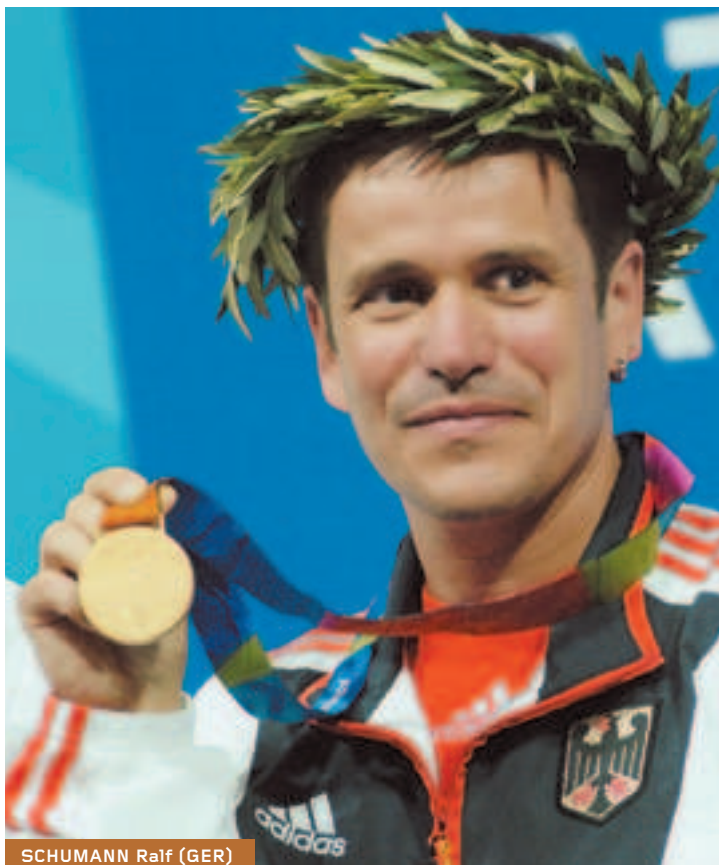
SCHUMANN Ralf (GER)

OBTENCIÓN DE MEDALLAS EN EVENTOS OLÍMPICOS POR NOC EN COMPETENCIAS DE PISTOLA VARONIL INDIVIDUAL Y POR EQUIPO 1896-2008