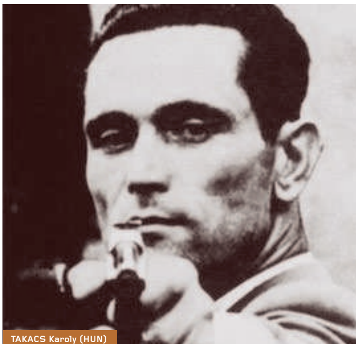
TAKACS Karoly (HUN)

Pistol shooting is part of the Olympic tradition since its beginning, as the founder of the modern Olympics – BARON PIERRE DE COUBERTIN – was a pistol shooter himself. But in the following years, some shooters were able to write their name in the history of the Games, and to become Olympic legends in their own right. Legends from the past, such as the most titled pistol shooter of all times – USA's ALFRED LANE , a five time Olympic medalist between 1912 and 1920. Or such as famous Hungarian shooter KAROLY TAKACS , mentioned in all shooting history books. He was a top athlete for years as member of the Hungarian team, but in 1938 a hand grenade blew off his right hand. Not a big deal for the right handed world team title holder, who taught himself to shoot left handed and won two gold medals at the 1948 and 1952 Olympic Games. Events like that happened in the past, so it should not surprise us that in 1896, a Danish shooter, LOUIS HOLGER NIELSEN was able to win three medals, two in shooting and one in fencing!