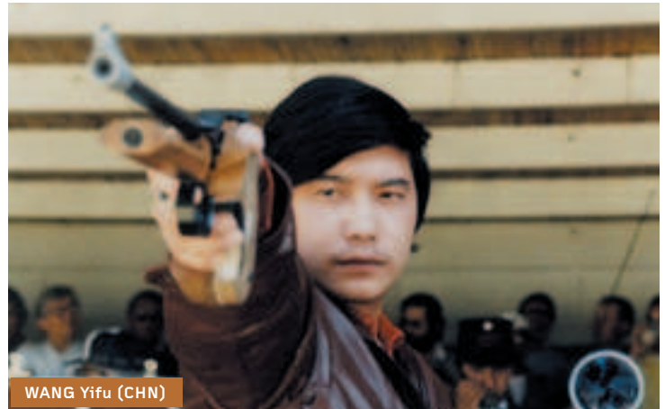
WANG Yifu (CHN)

When looking at the medal standings by team, the USA pistol team still stands on top of the rankings, with a total of 21 Olympic medals won in individual men and team events – 17 medals if considering individual events alone. CHINA and GERMANY follow, with China winning ten individual medals in men events, and Germany earning nine.