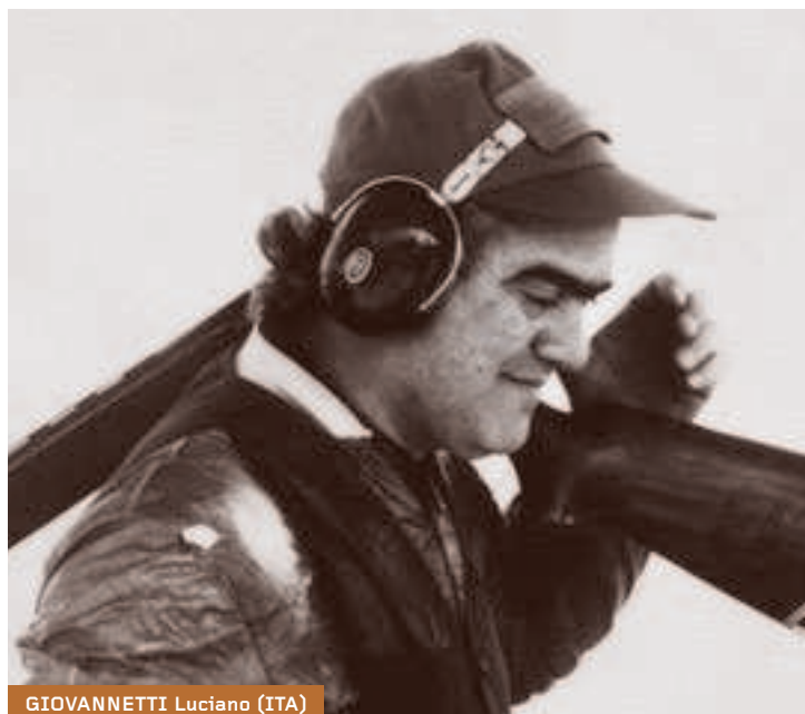
GIOVANNETTI Luciano (ITA)

Italy's LUCIANO GIOVANNETTI , a Trap master, was the first man to win two Olympic Gold back to back in Shotgun events, in 1980 and 1984, and remains probably one of the best trap shooters of all times. In 2000, Australia's MICHAEL DIAMOND joined him, winning his second Gold back to back in Trap, after his victory at the 1996 Atlanta Games. Diamond, who finished in fourth at the 2008 Games in Beijing, is still looking for glory, and there are few doubts that he will try to go for his third Olympic Gold in London.