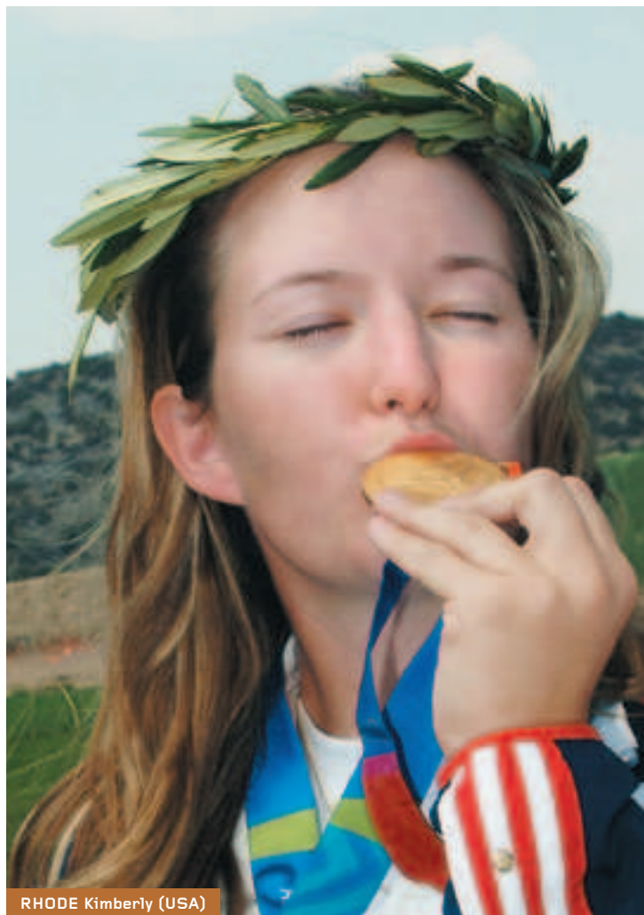
RHODE Kimberly (USA)

dred clays on the second day to take the Olympic title with a score of 198 points out of a possible 200. On the first day, Braithwaite missed only the fifth and thirteenth clay, so this meant that he scored 187 consecutive hits, an incredible achievement in those years. The youngest Olympic medal winner of all time, in Shotgun events, has been the American top shooter KIMBERLY RHODE , when she secured Gold at the Double Trap Women event at the 1996 Olympics in Atlanta at the age of 17 years. Once the Double Trap Women event was discontinued, after the 2004 Games, Rhode did not hesitate and changed to Skeet, keeping on winning. Nowadays, she is the only shooter of the world holding four individual medals from four different Games, and she will have a chance of winning her fifth award in London, next July. (Table 9)