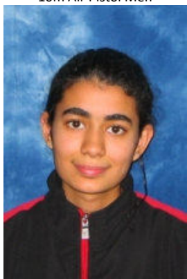
DESWAL Yashaswini Singh (IND) 10m Air Pistol Women